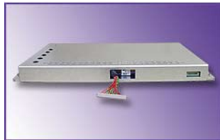
Top (From left to right) - LVDS connector - Inverter connector