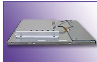
Back - Attached to a 17" LCD panel