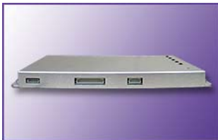
Bottom (From left to right) - Inverter connector - Analog R.G.B. input connector - Power connector