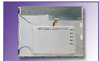
Back - Attached to a 17" LCD panel